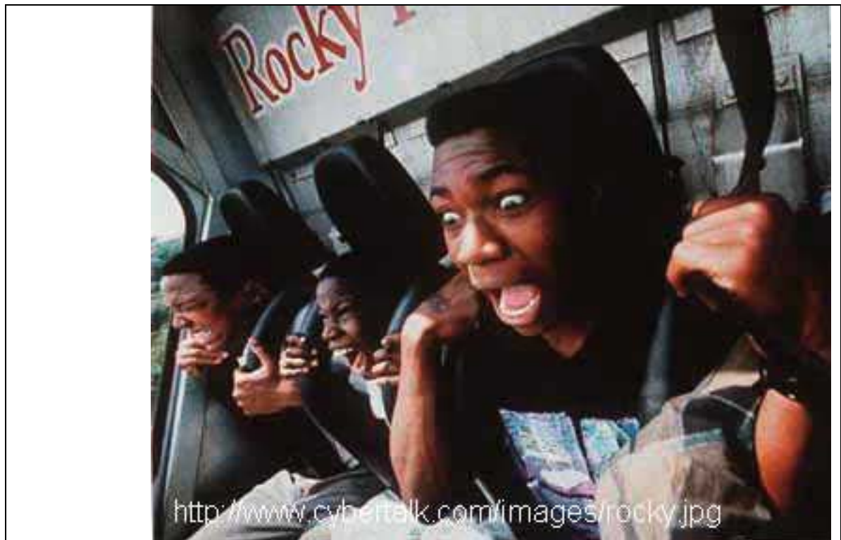
Figure 1.2 People pay money to get scared. The roller coaster pits one level of affect – the visceral sense of fear – against another level – the reflective pride of accomplishment.

Now let's look at some examples of these three levels in action; riding a roller coaster; cutting food for cooking with a sharp, well balanced knife, a good cutting board, and the act of dicing; and contemplating a serious work of literature or art. These three activities impact us in different ways. The first is the most primitive, the visceral reaction to falling, excessive speed, and heights. The second, the pleasure of using a good tool effectively, refers to the feelings accompanying skilled accomplishment, and derives from the behavioral level. This is the pleasure any expert feels when doing something well, such as driving a difficult course, playing a piece of music, or reciting a poem or joke to an appreciative audience. This behavioral pleasure, in turn, is different from that provided by serious literature or art, whose enjoyment derives from the reflective level, and requires study and interpretation.